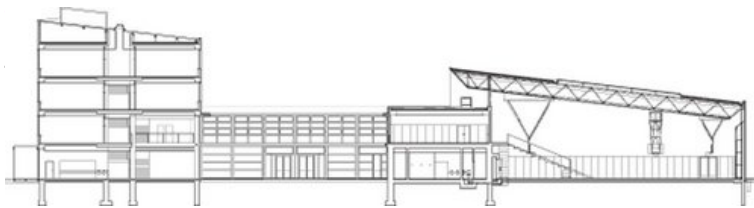
The secondary medicinal school 02