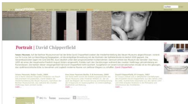
nextroom screenshot of the portrait-feature of David Chipperfield using images of Nick Knight, Ute Zscharnt, 2009