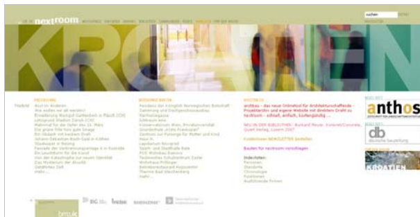
nextroom frontpage on the occasion of the start of the Croatian building collection using an image of Robert Leš, 2008