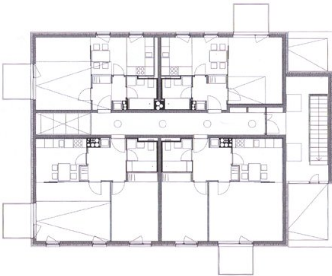
Polje Social Housing in Ljubljana floor plan