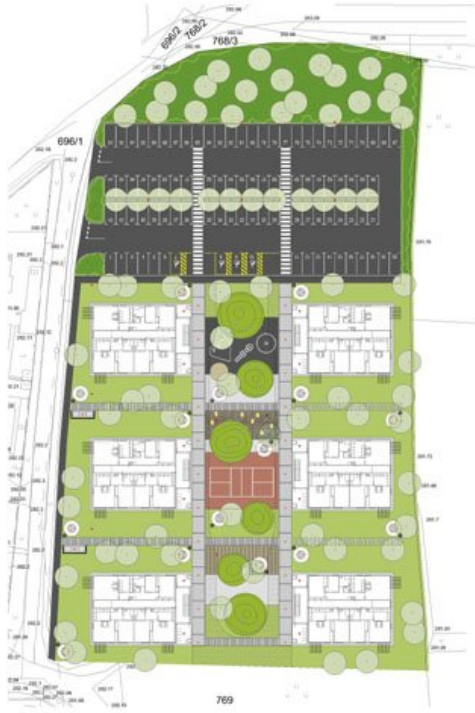
Polje Social Housing in Ljubljana situation