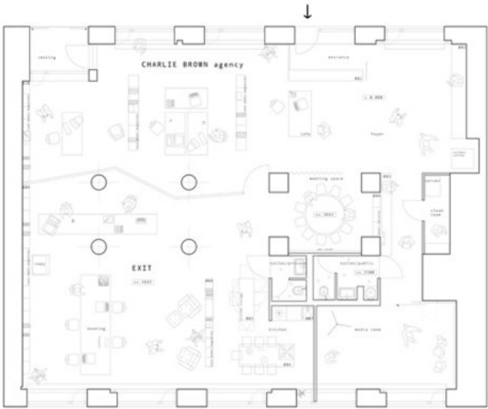
Exit MM + Charlie Brown