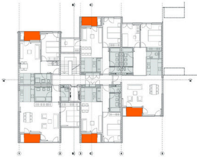
housing L floor plan