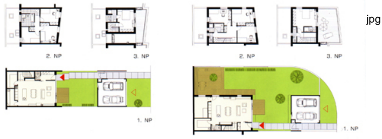
„Nice living“ terraced house in Bratislava